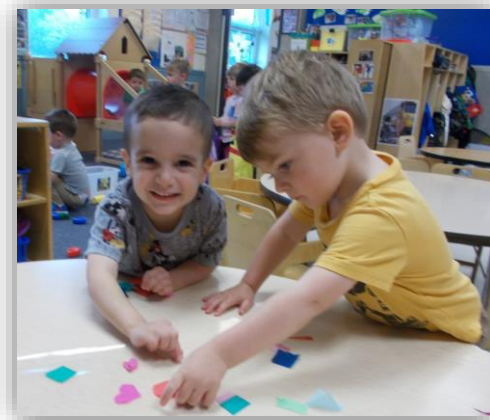
Hard at work!