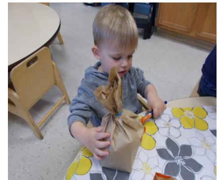
Toddler Artists at work!